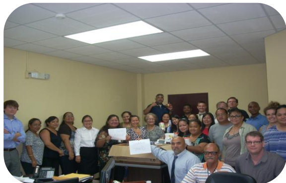
Guam Attorney General's Office donates relief goods to the CNMI Attorney General's Office after the CNMI was struck by Typhoon Soudelor.